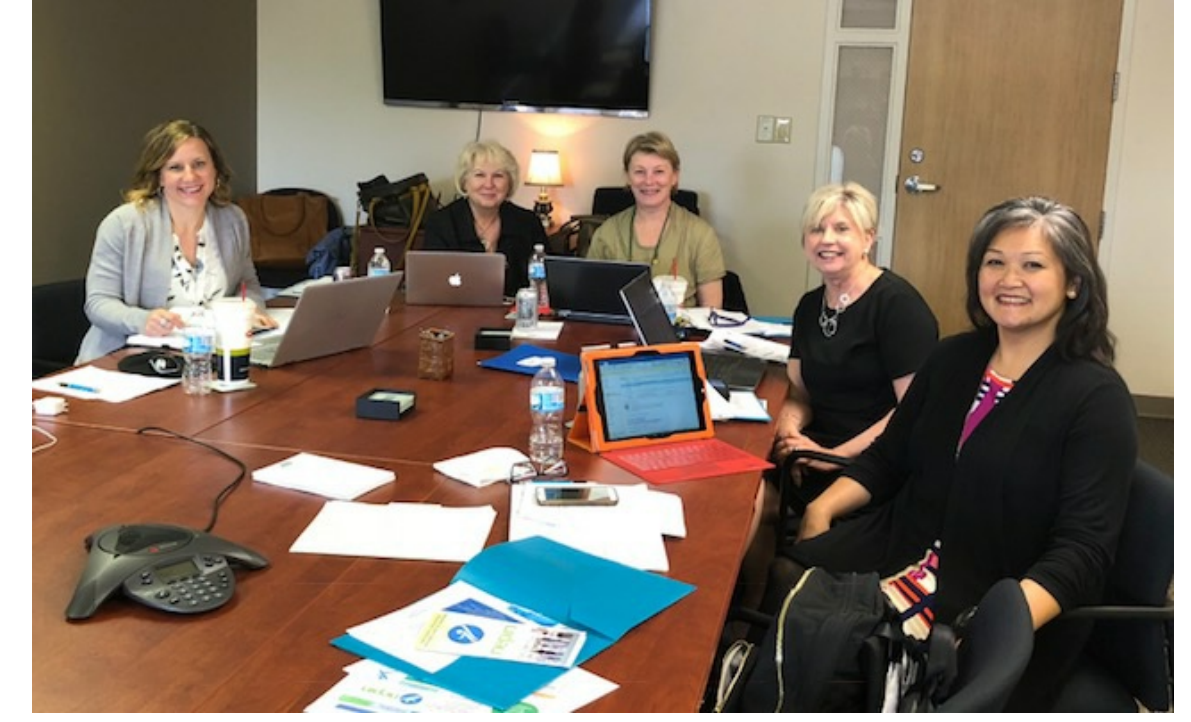
NEPIN team hard at work in Indianapolis.

HealthImpact | Events | Donate | Phone | Email | healthimpact.org