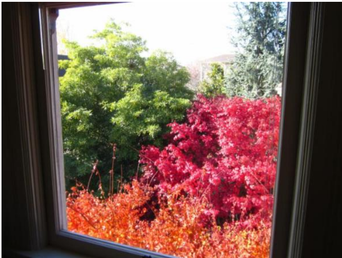
Awaiting autumn: HealthImpact office window at Preservation Park, Oakland in the fall of 2011