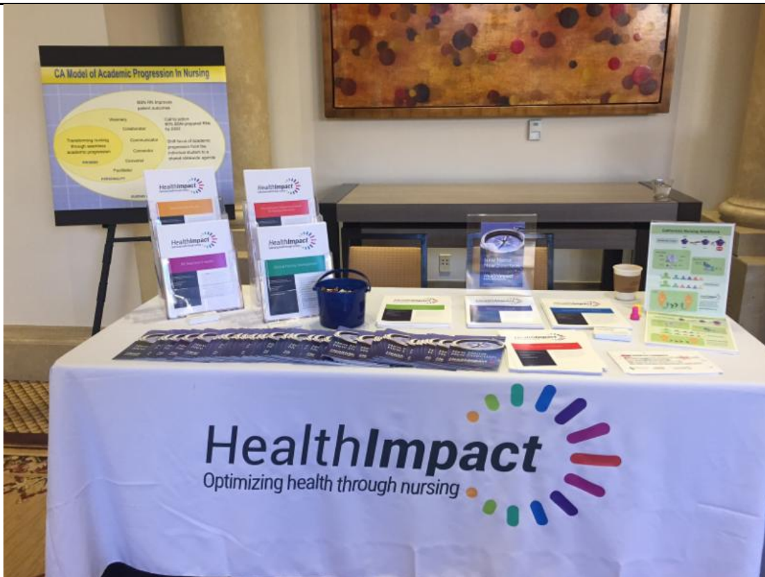
Our table at ACNL's 38th annual conference, "The Power of Us! A Force for Change" in Rancho Mirage, California in February 2016

To enhance the well-being of Californians through innovation, interprofessional leadership, and nursing excellence